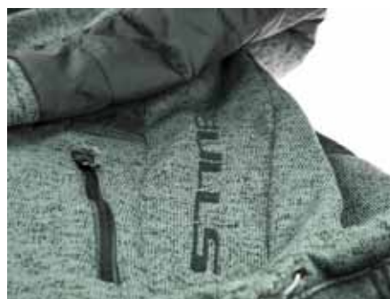
Lettering and small details in particular can be challenging to embroider.

If you want to realise soft embroidery on high-tech textiles, you should first select a suitable thread in the right weight. With the appropriate embroidery thread, the wearing comfort of the garment also increases noticeably. In general, the thinner the fabric, the finer the thread.