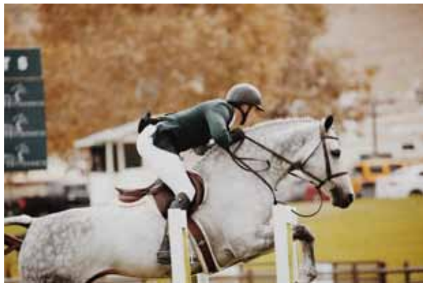
High standards - embroidery on functional clothing must withstand all requirements.

Whether ultra-light, breathable or water-repellent - functional fabrics differ greatly in their properties from conventional textiles. Their mostly smooth surface and high flexibility often pose challenges for embroiderers. In the following article, you will find out how you can still succeed in realising your ideal embroidery result.