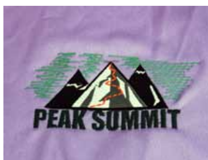
There are various reasons for puckering – you can learn how to avoid them

Whenever the needle penetrates the material's structure, fibres shift and the fabric warps. By using thin needles, puckering can be reduced. Needles with size NM 60 or NM 70 are particularly suitable for functional fabrics. The shape of the needle tip is crucial to prevent damage to the material.